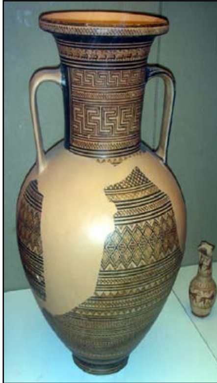
Elgin Amphora, British Museum

THE PARTHENON FRIEZE is displayed in the British Museum without gaps, so that visitors could be forgiven for thinking that they were looking at the complete work. But they would be deceiving themselves. The British Museum houses a little over half of the surviving Parthenon sculptures. The rest, with a few minor exceptions, are now on display in the New Acropolis Museum in Athens. Art that is divided cries out to be reunited. It is a cry which we know that Mr MacGregor, Director of the British Museum, has heeded at least twice in the past. When he was Director of the National Gallery in London a painting by Manet called, "The Execution of Maximilian" was put on public display for the first time in over a century. In Manet's lifetime it had been too dangerous to exhibit the painting, considered critical of the French Emperor, and on the artist's death his family had cut it up and disposed of the fragments separately. Outraged by this vandalism, Degas had tracked down the